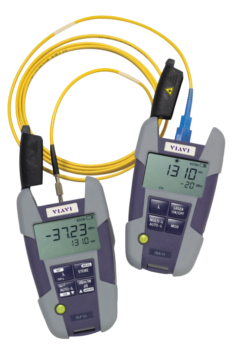
SmartPocket OMK-3x optical test kits include an OLS-3x optical light source, an OLP-3x optical power meter, and accessories