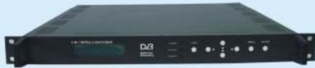
4 IN 1 MPEG - 2 Encoder