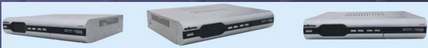
DVB-C Set Top Box