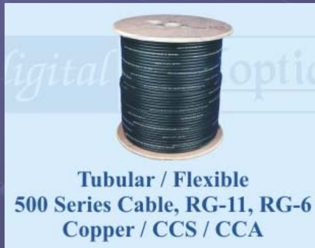
Tubular / Flexible 500 Series Cable, RG-11, RG-6 Copper / CCS / CCA