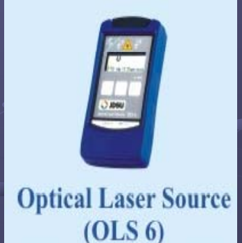
Optical Laser Source (OLS 6)