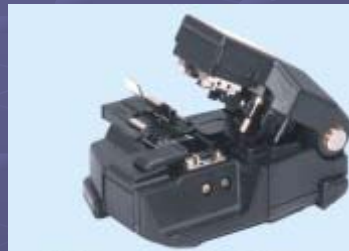
Clever CT 30