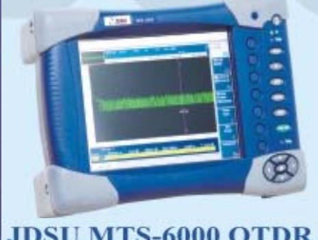
JDSU MTS-6000 OTDR