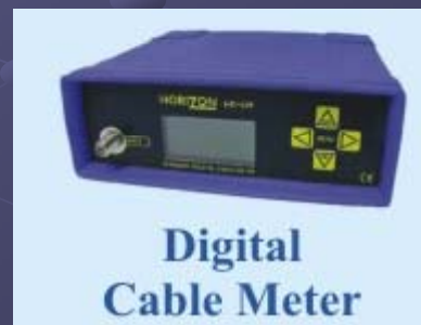
Digital Cable Meter