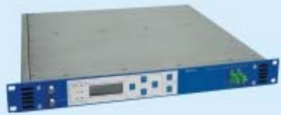
Bktel 1550 Nm ES10XL