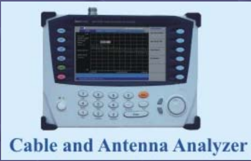
Cable and Antenna Analyzer