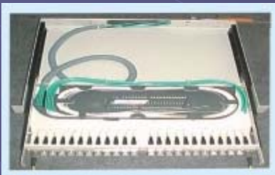
3M Fiber Management System