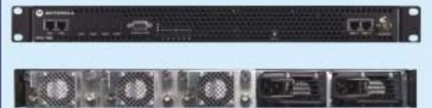
Edge QAM APEX 1000