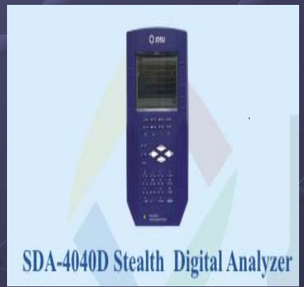
SDA-4040D Stealth Digital Analyzer