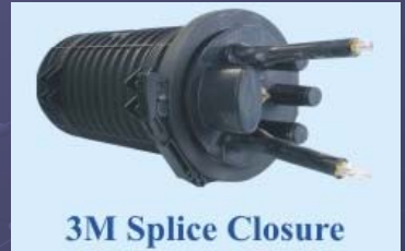
3M Splice Closure