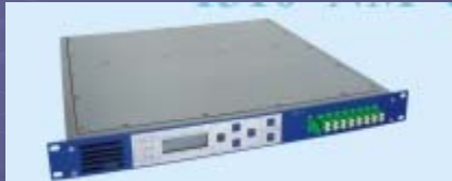
Bktel EDFA OVxxxx