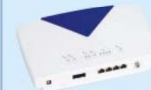
Optical Network Unit