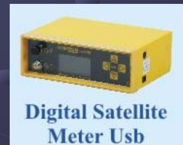
Digital Satellite Meter Usb