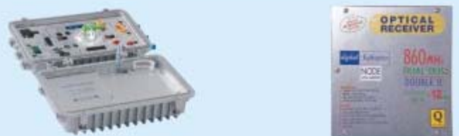
KO 2E/2D Node