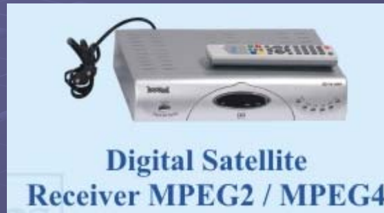
Digital Satellite Receiver MPEG2 / MPEG4