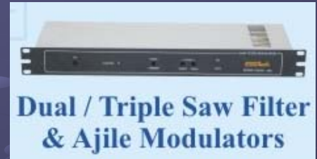
Dual / Triple Saw Filter & Ajile Modulators