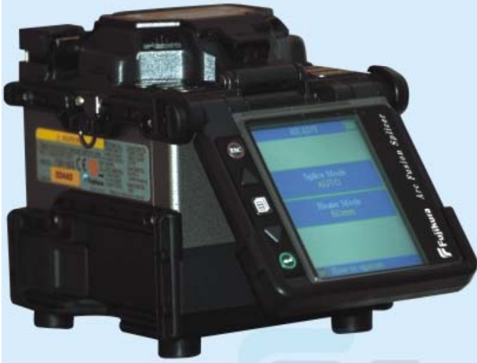
FUJIKURA FSM 60 S