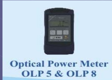
Optical Power Meter OLP 5 & OLP 8