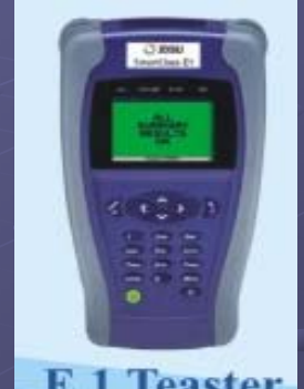
E 1 Teaster