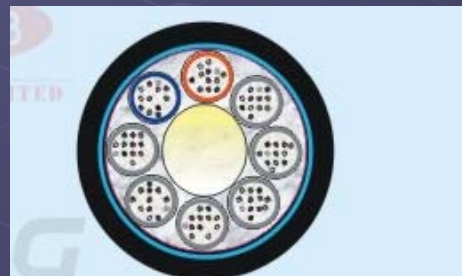
96F SM CATV AERIAL OPTICAL FIBRE CABLE